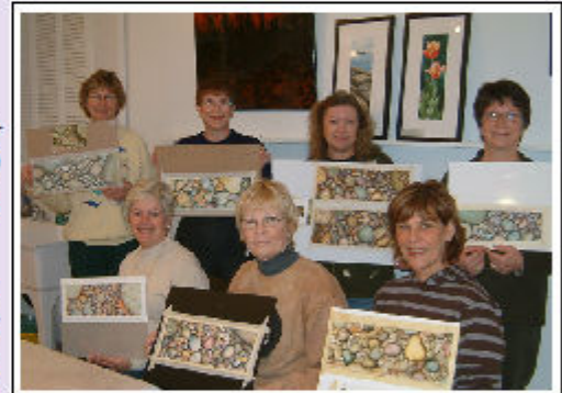
Pictured above are seven of Karen's happy students in her Winter 2008 classes at Meta4, with their completed 'Rocky Beach' paintings.

This popular, information-packed course will help intermediate and advanced level students hone their skills to produce dramatic, realistic watercolour paintings. Create a collection of small paintings with subject matter chosen from landscape, floral and architectural photos provided by Karen. Course fee: $130. plus GST, plus a $5 materials fee payable to Karen. Classes are filling up quickly so call now to avoid disappointment.